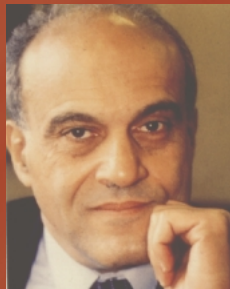
Professor Sir Magdi YACOUB, FRC (London)